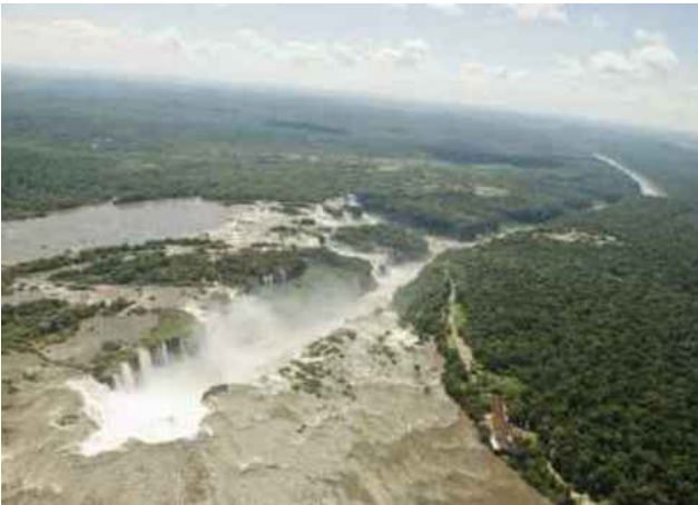
The Iguazu Falls, a transboundary protected area between Argentina, Brazil and Paraguay.