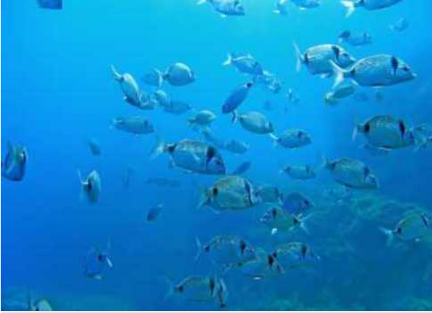
Two-banded seabream ( Diplodus vulgaris ) in the Medes Islands SPAMI, Spain.