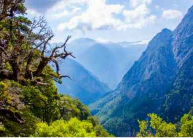
Samarias gorge, Crete, Greece. The island of Crete is a CPD.