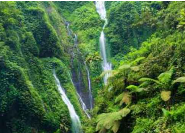
Madakaripura Waterfall in the biodiversity hotspot of Java, Indonesia.